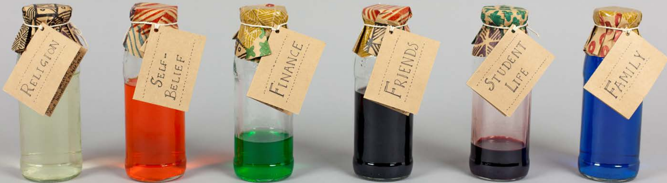
Lubna Jamaldin 'Six bottles of liquid', Tell Us About It Archive UAL Archives and Special Collections Centre