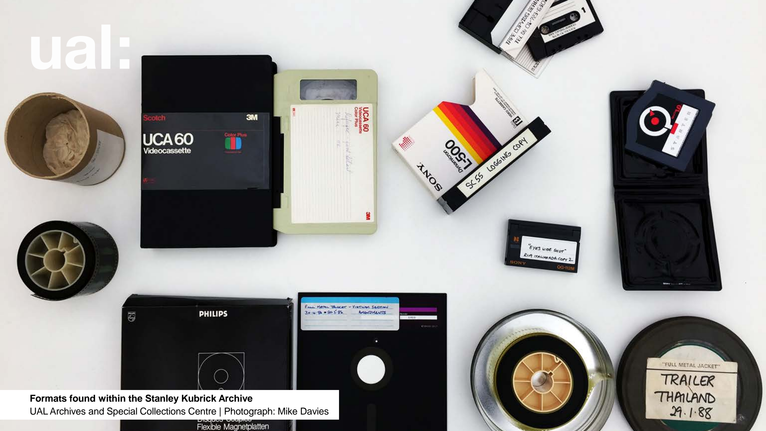
Formats found within the Stanley Kubrick Archive UAL Archives and Special Collections Centre