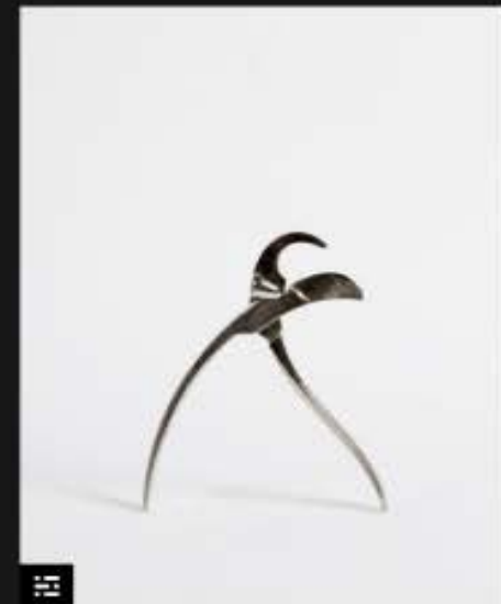
Screenshot from user interface development work UAL Digital Collections | Photograph: Elisabeth Thurlow