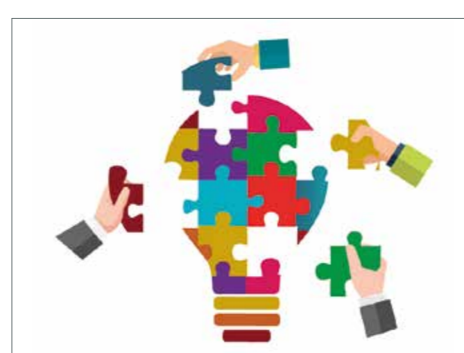
Developing in house skills and knowledge to mainstream support