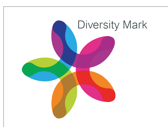
Diversity Mark Award