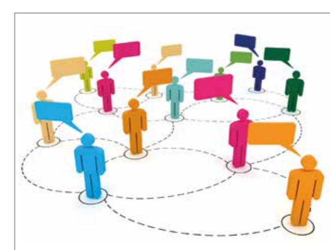
Network development to share practice and knowledge

Winners of the Talis Aspire User Group Creativity Award 2019