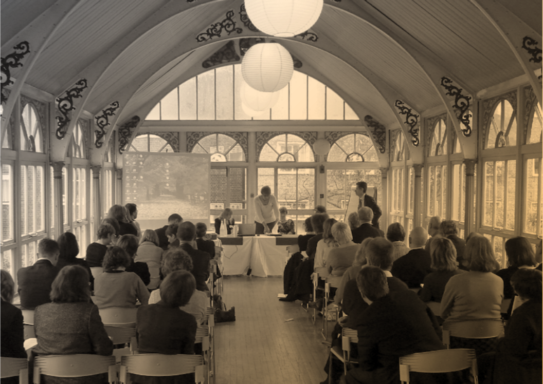
Left and middle right: Members’ Day at Goldsmiths. Middle left and bottom: M25 Steering Group.