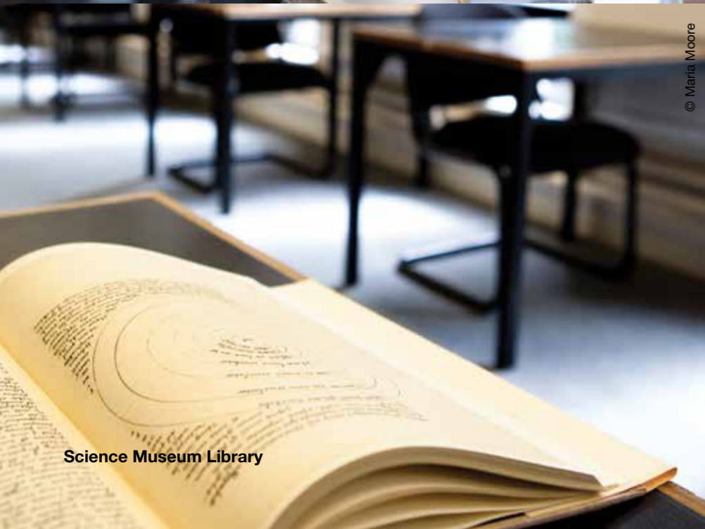
Science Museum Library