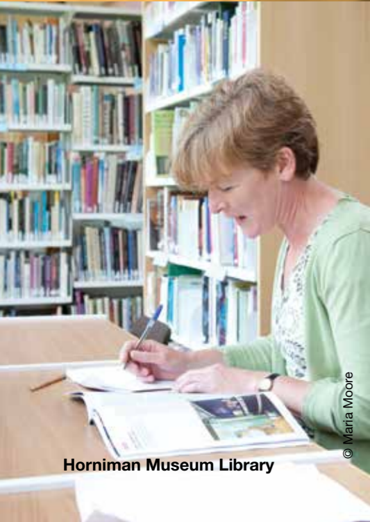
Horniman Museum Library